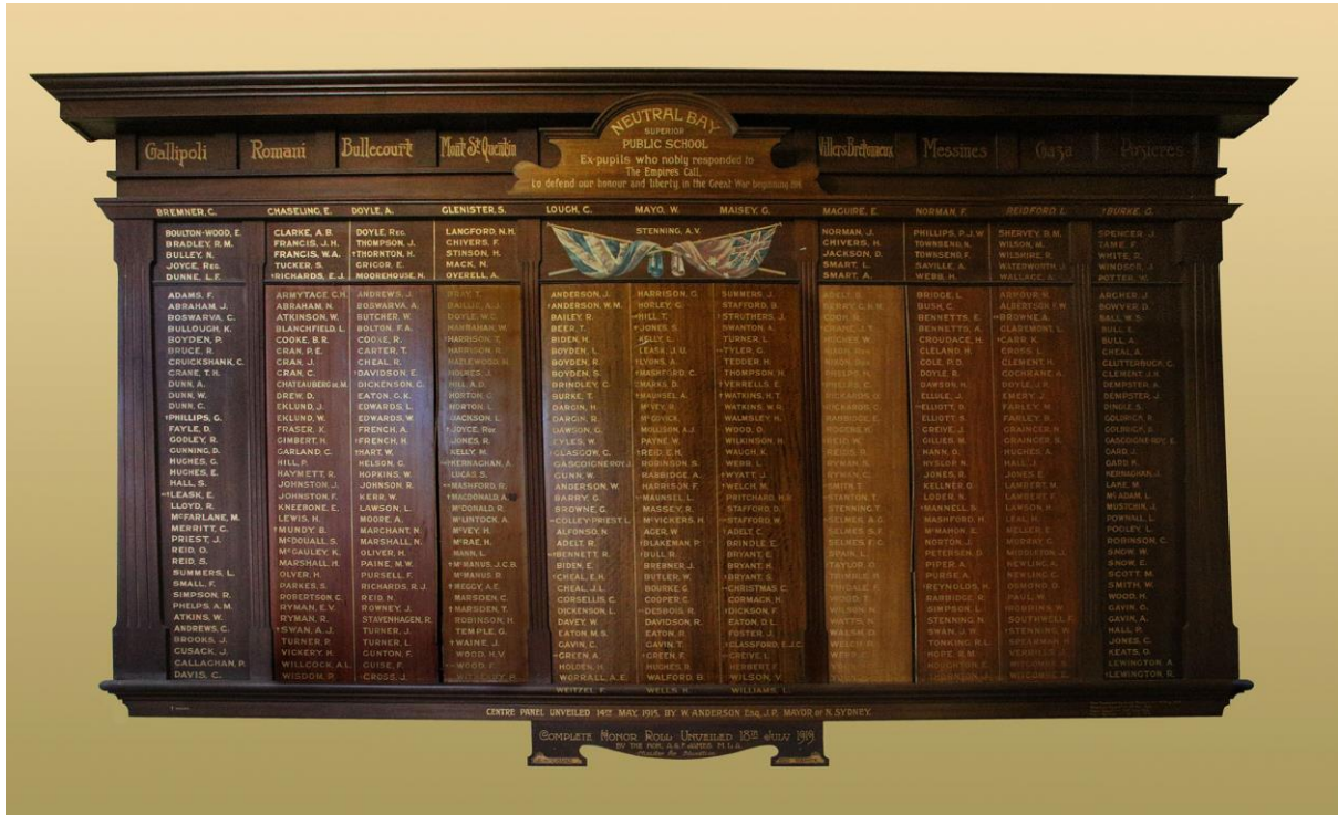
Neutral Bay Superior Public School Honour Roll