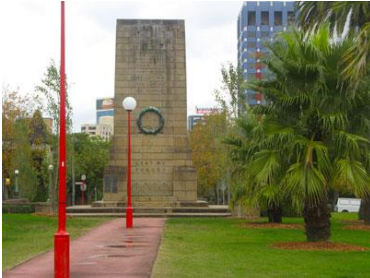
North Sydney War Memorial